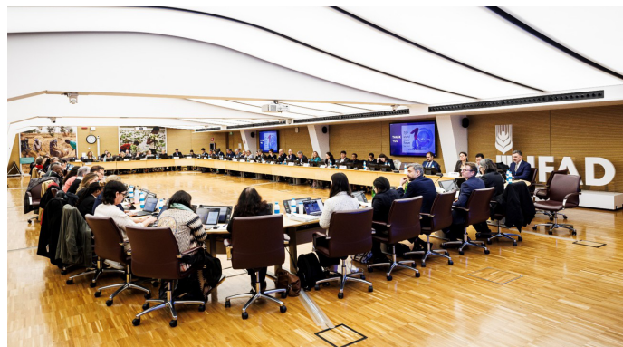
CW participation in the UN-Water Meeting, Rome, March 2024